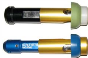
Sonic head, for the installation of cables with low stiffness