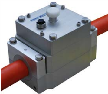
Lubricator L18, for the continuous lubrication of cables for a better Jetting performance