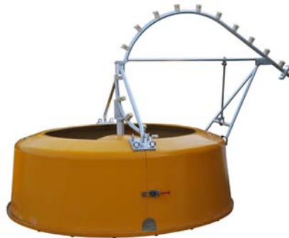
Figaro, intermediate cable storage system, avoiding figure of 8