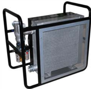
Air after-cooler, to increase Jetting performances when ambient temperature is over 20°C