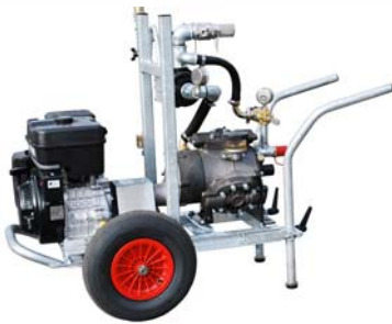
Hydrocab-080, accessory for cable installation with water (floating), 80 l/min